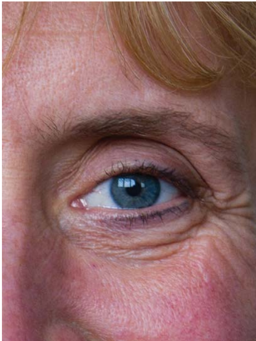
FIGURE 7-16 Deep Eyelids. The woman in this picture has a large upper eyelid that goes back deeply indicating that she has suffered in the past and while suffering, probably couldn't eat much. This is a sign of a slight earth deficiency and metal strength.

the bearer suffers easily and often. When they are upset, they do not eat or sleep and lose weight and money easily. This is a sign of earth deficiency because they have trouble holding onto things, including their energy, when they are suffering and often belongs to metallic people (see Chapter 8).