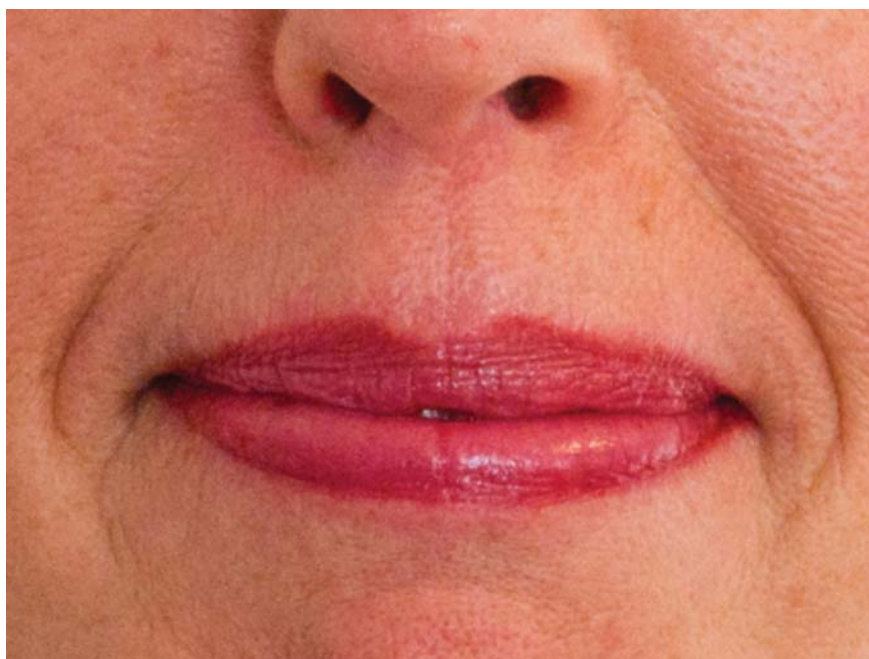
FIGURE 7-10 Larger Upper Lip. The woman in this photo has an upper lip slightly bigger than the lower. She can be dramatic about her feelings and enjoys expressing her emotions.

Chinese is that these people would rather fight than be bored. This trait is exaggerated when the lip is very puffy.