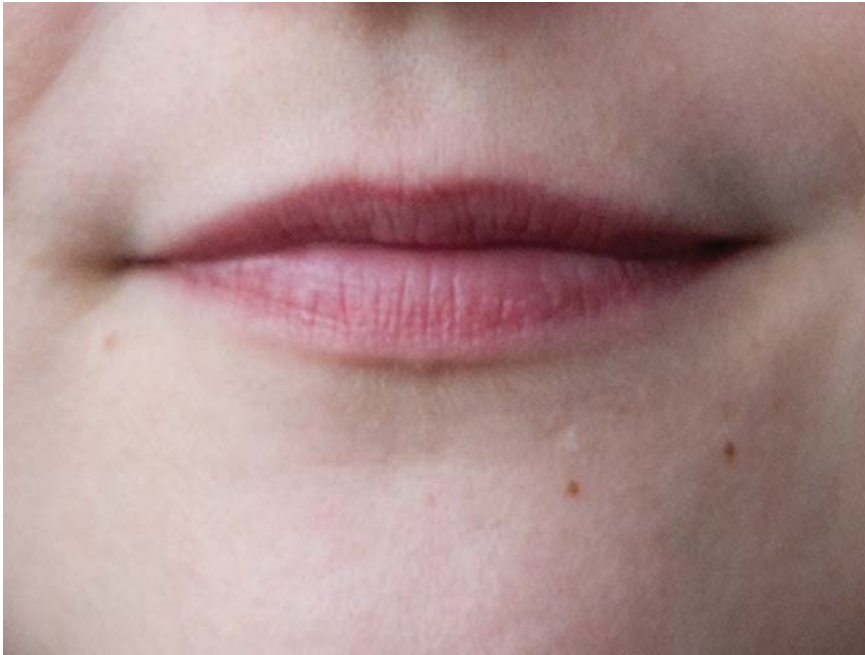
FIGURE 7-14 Singer's Mouth. The lips on this woman show good muscle tone indicating she has good control of the diaphragm, which gives her the ability to use her breath to sing.

puffy and dark, you have signs of digestive stagnation and most likely, constipation.