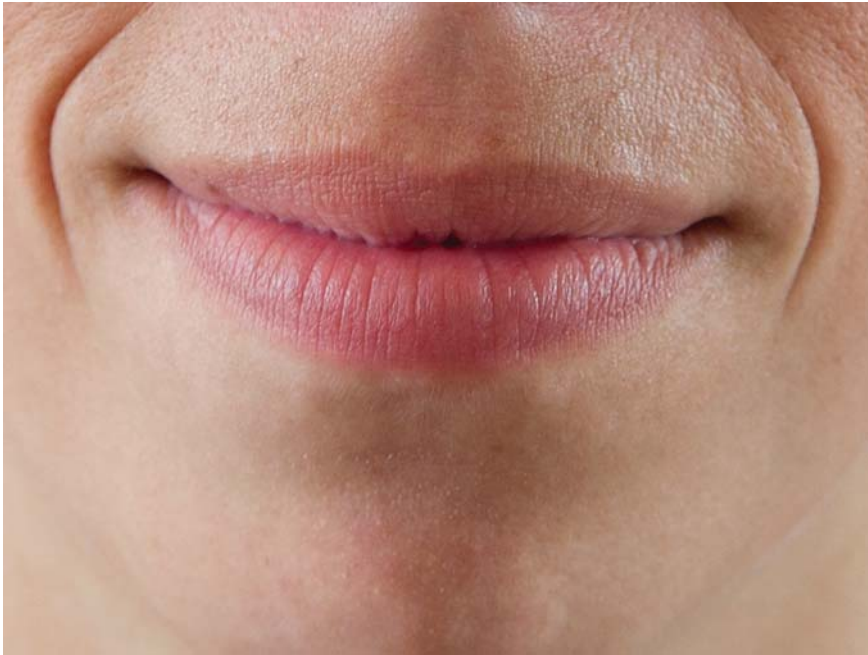
FIGURE 7-11 Protruding Lips. This woman's lips are close over teeth that protrude making her lips protrude as well. This is a sign of a talkative person and she needs to let herself communicate more.