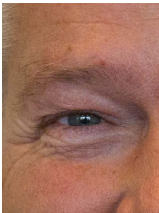
FIGURE 7-15 Full Upper Eyelids. The man in this photo has slightly puffy upper eyelids, indicating that he has slight spleen dampness at present but he also has the ability to save money and invest in real estate.

In Chinese medicine, puffy upper eyelids are a sign of earth excess. This trait is also associated with spleen dampness, where the dam of earth keeps the water contained and stagnant. This contributes to weight gain and obesity. The emotional correlate is that these kinds of people do not suffer for love and never lose their appetite. People with puffy upper eyelids (Figure 7-15) are also supposed to be very good at saving money and investing it, especially in real estate. When the upper eyelid is sunken, hollow, or deeply lidded (Figure 7-16),