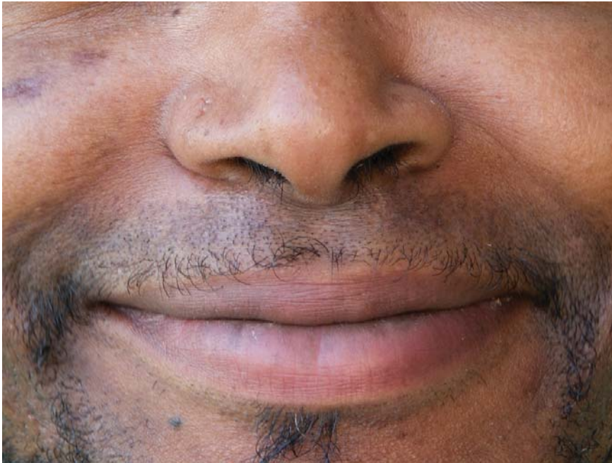
FIGURE 7-1 Large Mouth. This man has a large mouth with full lips especially compared to a refined nose. This mouth indicates a generous nature and strong earth energy because of the fullness of his lips. He is a warm person and gives easily.

forming the shapes to speak words. It is the second most changeable feature on the face, after the eyes. Most major expressions require movement of the mouth. The mobility of the muscles around the mouth and the softness and thinness of the skin of the lips allows people to change its shape and mark it. Unfortunately, most people press down on their lips and make them smaller. However, it has been shown in many studies that women are considered more attractive when they have full lips as this is seen as a sign of sexuality, whereas men are considered more masculine if their lips are not too full.