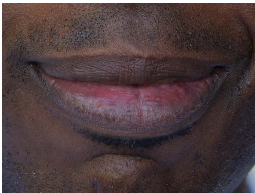
FIGURE 7-13 Very Full Lower Lip. This man's very full lower lip indicates that he is a gourmand and no doubt loves good food, good company, and beautiful surroundings.

upper lip is also very puffy, it is a sign of hedonism. People who have a protruding lower lip pout well when they don't get their way and this can be a sign of self-indulgence.