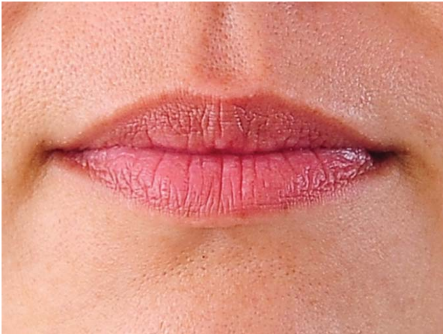
FIGURE 7-6 Small Mouth with Full Lips. The small mouth with full lips on this woman indicates that she has strong emotions and the ability to express them to intimates. Her generosity is reserved for those who are close to her, and she is particular about what she gives.