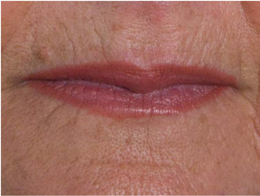
FIGURE 7-9 Pursued Mouth. The woman in this photo has lines around her entire mouth indicating that she has followed the rules and probably doesn't feel rewarded for having always done the right things.

be. People with full lips do not usually have a stronger sex drive. Their need for sensuality can be met in many ways. They love the feel of a creamy pudding or the softness of silk against their skin. They can usually find many ways to experience their sensuality, of which sex is only one aspect.