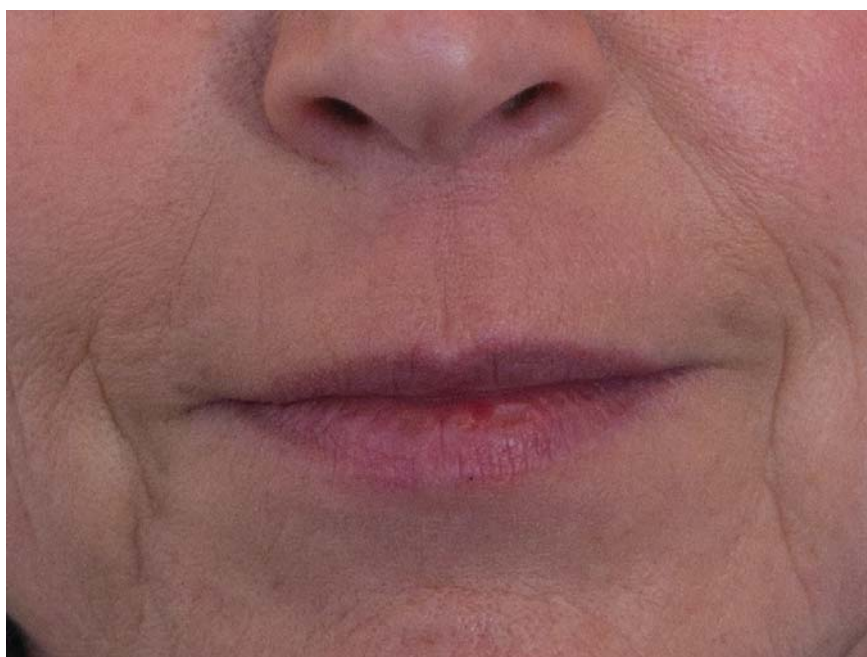
FIGURE 7-8 Refined Mouth. This woman has a mouth that is very refined, indicating that she has very good taste and picks presents that are beautiful and individual for people close to her.

People whose lips are refined have very good taste and tend to be more specific about giving (Figure 7-8). They like to give gifts that have aesthetic value and appropriate to the person. If the mouth is small and the lips are thin, these people have a little more trouble giving or expressing. They are more conditional about their gifts and feel that people should earn their gifts, or they give because they know that they have to. If the lips are held tight, it is a sign that these people have great self-control. They do not express easily or well and can appear to be lacking in warmth. Of course they do feel, but all feelings are kept hidden and out of view. They have great abilities to suppress emotions and hold onto money. If the lips are pinched, the bearer is a tightwad, both financially and emotionally.