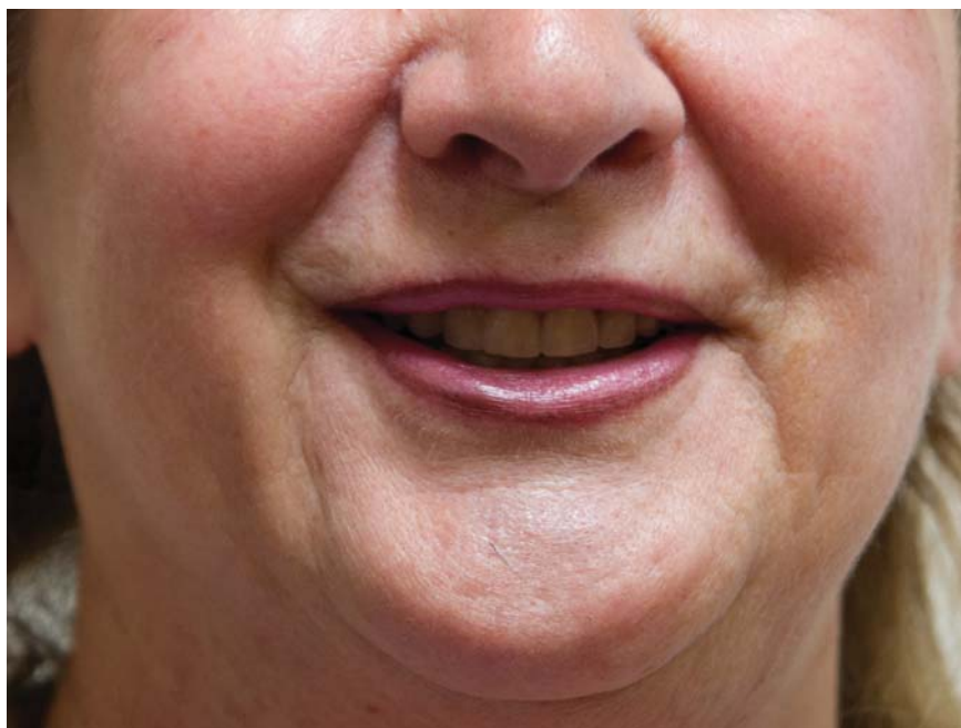
FIGURE 7-22 Happy Face. The woman in this photo has padding across the lower part of her face indicating that she has the extra earth energy to act friendly and present a happy face, even when she is not feeling that happy.