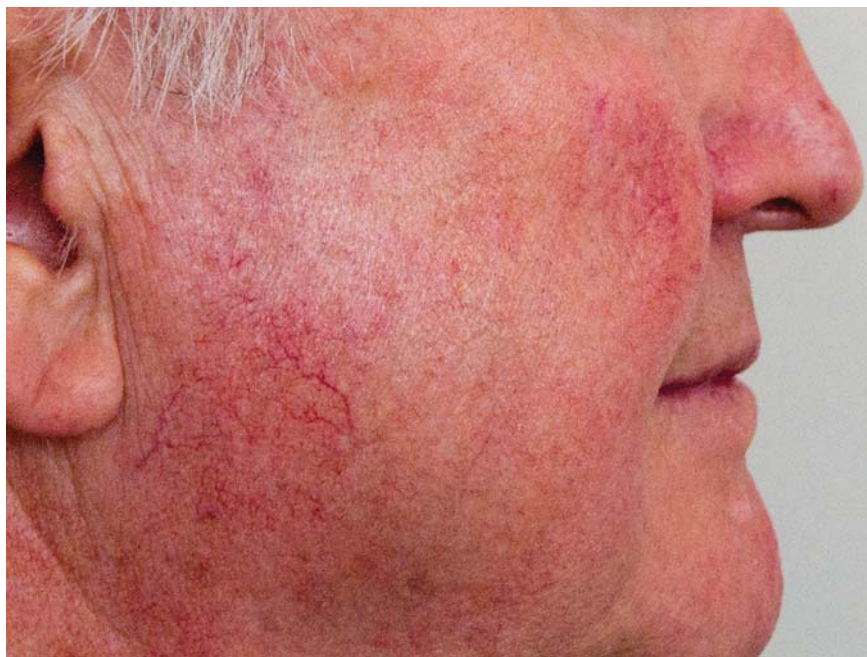
FIGURE 7-17 Full Moneybags. The large moneybags on this man's face show that he knows how to save money, invest and accumulate things of long-term value.