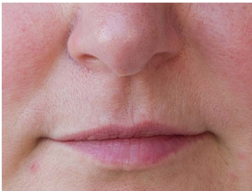
FIGURE 7-2 Small Mouth. This woman has a small mouth, so she doesn't give quite as easily because she has less earth energy to give from. However, the fullness of her lower lip means she likes to give and receive pleasurable experiences.

People with average-sized mouths still have generosity but are more particular about to whom and how much they give. People with small mouths (Figure 7-2) find it difficult to give unless there is a good reason, as they are more conditional about their giving. They give because someone deserves it or because they are supposed to give something and do so based on practicality more than emotion. But don't misunderstand—they do give but more selectively.