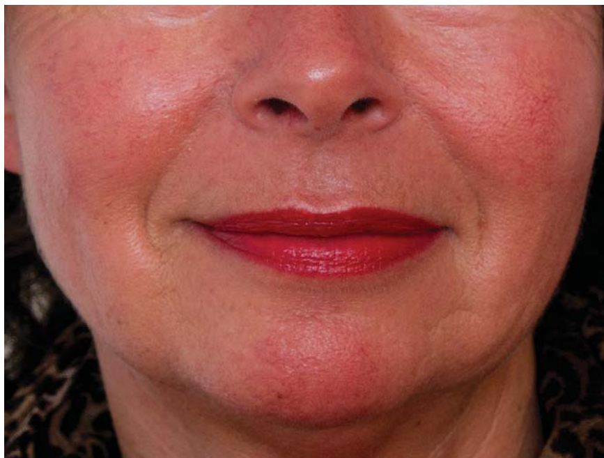
FIGURE 7-18 Moneybags—Peaches. The lovely moneybags on this woman's face are soft and pink. This shows that she knows how to live well, enjoy life and probably saves energy and money well too.

Instead, this area should look like the skin of a peach, with a rosy blush, firm but soft and full. If the skin sags here, it is a sign of depleted earth energy.