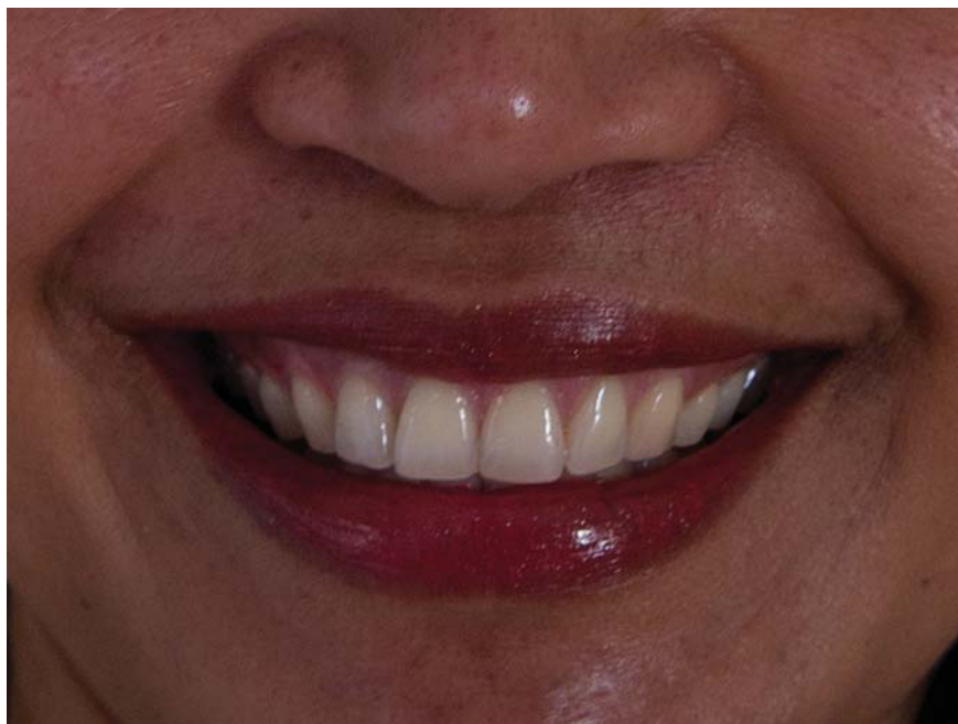
FIGURE 7-4 Full Lips. This woman has a generous mouth with full lips. These traits show maximum generosity and the ability to express emotions easily.