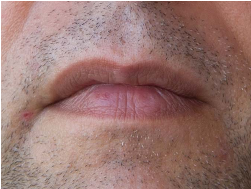
FIGURE 7-7 Cupid's Bow Mouth. The curved upper rim of this man's mouth indicates that he loves giving presents to show his love.