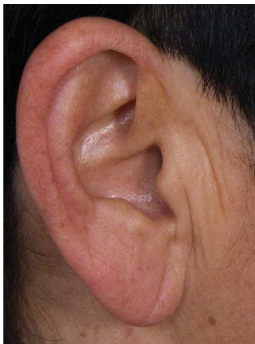
FIGURE 7-19 Plump Earlobes. Although these earlobes are not that long, they are wide and plump indicating luck in old age from the water element and from the earth element that stops the water from flowing away like a dam in the river.