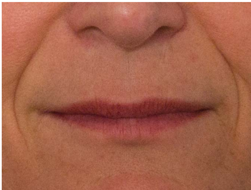
FIGURE 7-5 Thin Lips. This woman with a wide mouth and thin lips doesn't express her emotions that easily but is generous, especially to those she loves. She is likely to give money or gift certificates.