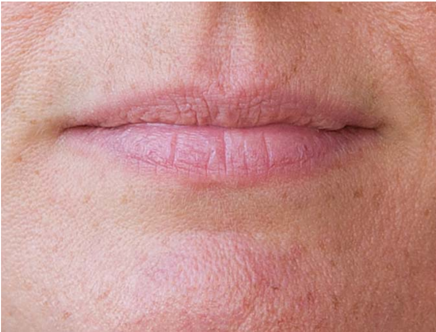
FIGURE 7-3 Compressed Lips. The woman in this photo is holding her lips together in a slightly compressed way. This is a sign of a reserved person who holds her feelings in.

their lips tightly together. Many men have their lips compressed into a thin line. Westerners see this as a sign of a strong man who is in control of himself and his emotions. In actuality, it is a sign of repression and can lead to an inability to express. Men are expected to have a “stiff upper lip.” This usually means that they don’t have much of one at all!