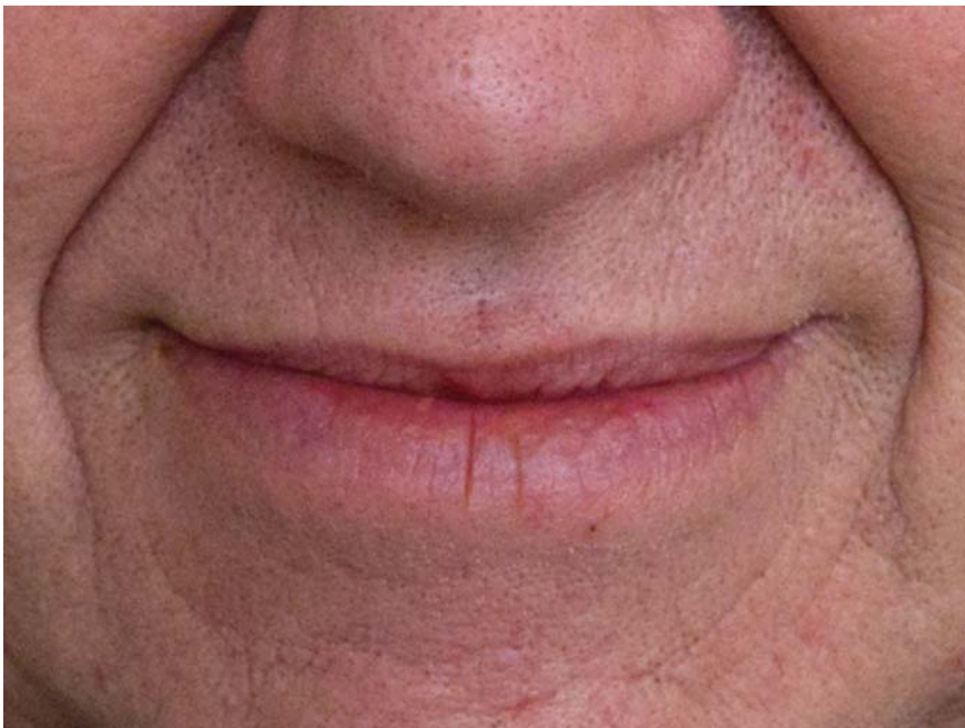
FIGURE 7-12 Bigger Lower Lip. The man in this photo has a bigger lower lip, which indicates his desire for physical pleasure and comfort.