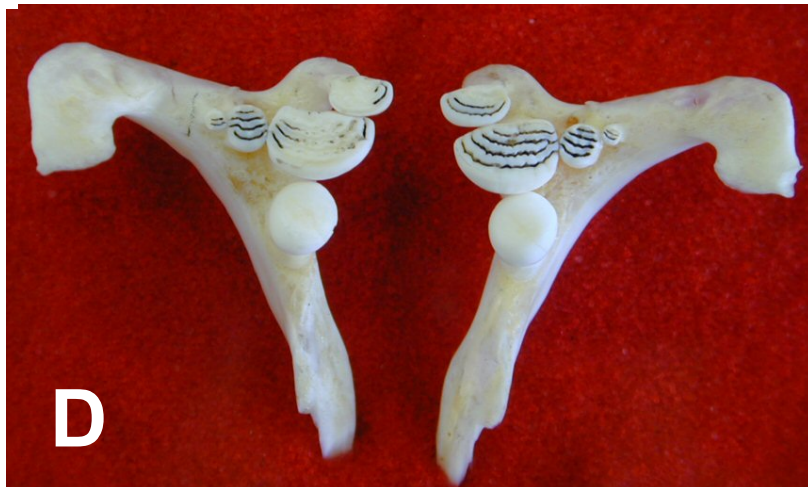
©Figure 22.3 Gelwick and McIntyre 2017. In: Hauer and Lamberti (eds.) Methods in Stream Ecology . Elsevier.