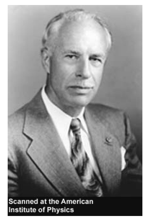
Figure 3 Leason Heberling Adams (1887–1969), American Geophysical Union (AGU) President 1944–47, Bowie Medalist 1950.

Despite the power and insight provided by theory, mineral physics is dependent upon quantitative highpressure and -temperature experimental results. Such work was pioneered by Williamson, Adams (Figure 3), and Bridgman, and then taken up by others such as Ringwood, Bassett, Liu, and many groups in Japan (see, e.g., Akimoto (1987) and Figure 4), but in the past 30 years huge advances have been made and today, for example, laser-heated diamond anvil cells can be used to access temperatures and pressures up to \sim 6000 \text{ K} and 250 GPa. Such experiments, however, can only be carried out on very small sample volumes and for very short periods of time. Multianvil experiments can be used to study much larger volumes of material and are stable over a longer time interval. These techniques are, therefore, complementary and are both developing rapidly. Chap Ito provides a review of multianvil cell