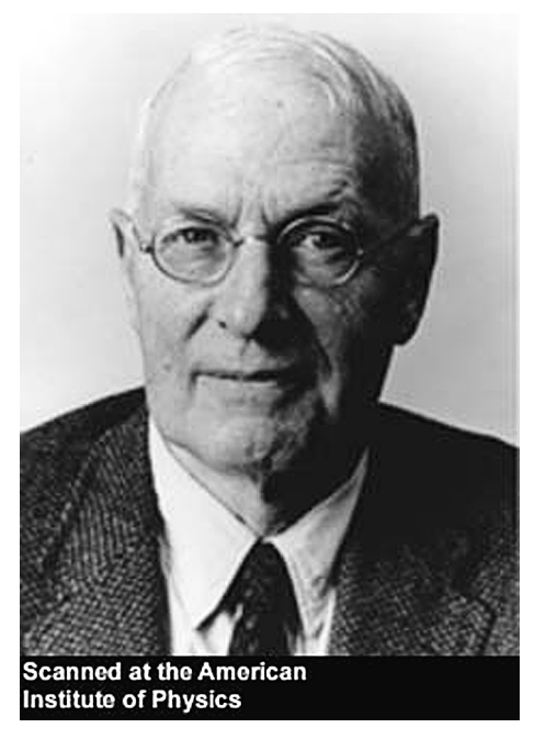
Figure 1 Francis Birch (1903–92), Royal Astronomical Society Medalist 1960; Bowie Medalist 1960.

octahedral coordination and from Takahashi and Bassett (1964) who first made the hexagonal closepacked polymorph of Fe, which is today thought to be the form of Fe to be found in the Earth's core (but see Chapter 2.05). As high-pressure and -temperature experimental techniques evolved, still further phases