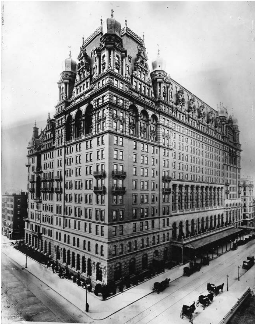
FIGURE 1-4 Waldorf-Astoria Hotel. This sprawling hotel was an 1898 combination of the Waldorf and Astoria hotels (1891–1893 and 1895–1897) in New York City. Collection of the New-York Historical Society from the George Hall collection.

An example of a hotel of this era was the Waldorf-Astoria (Figure 1-4) in New York City.